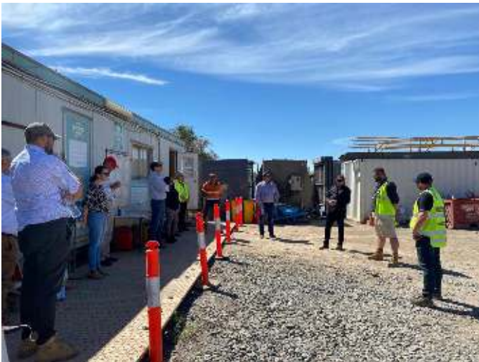
RD&E Committee visiting the Lens Snail eradication site at Largs North

The Market Ready campaign is an initiative of the SA Grain Market Access Group, delivered by GPSA with the support of the Federal Government's Agricultural Trade and Market Access Cooperation Program.