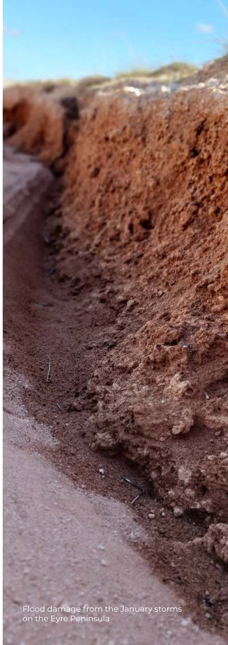
Flood damage from the January storms on the Eyre Peninsula

GPSA is ultimately accountable to all grain producers through the ongoing support for voluntary contributions made to the Grains Industry Fund each year.