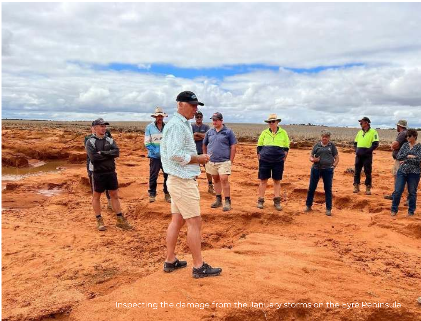
Inspecting the damage from the January storms on the Eyre Peninsula